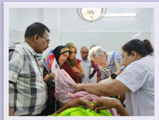
Hands-on Training to local Gynae Practitioners by foreign faculty

Prolapse, a condition often linked to childbirth and inadequate healthcare, can severely affect a woman's quality of life, causing physical discomfort and emotional distress. IFB's 'Proshanti' project has been supporting poor female patients with uterine Prolapse since January 2017 in partnership with DAK Foundation/ PFE Australia. As part of this project, IFB has established 23 specialized facilities at 4 Government Medical College Hospitals and 18 private clinics with trained Gynecologists, who received hands-on training from a team of overseas