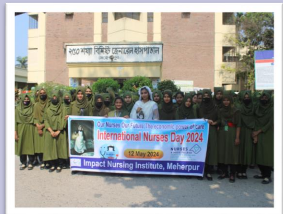
Celebration of the International Nurses Day 2024