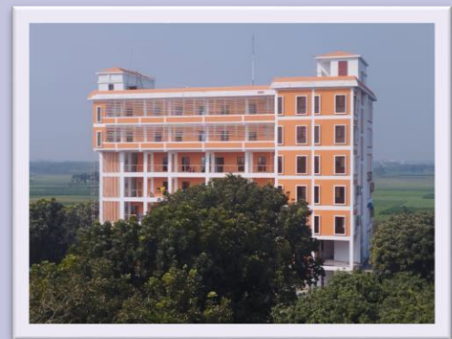
Outer view of the under construction 'Jibon Mela' Nursing Academic Building

ensure that the nurses are well-prepared to face the challenges in their career and contribute meaningfully to their communities and the country.