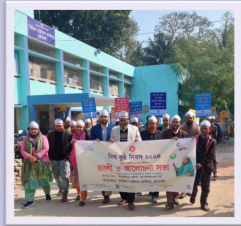
Celebrating World Leprosy Day 2024

Additionally, IFB has supported the formation of Self-Help Groups (SHGs) for the engagement of the group members in income-generating activities to support themselves, and their families.