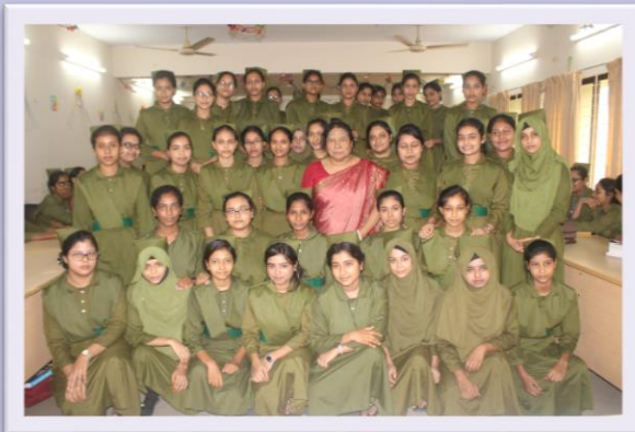
INI Students with their Principal

IMPACT Nursing Institute, IFB's educational initiative, was founded in March 2014 to offer a