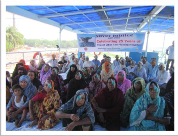
Silver Jubilee Celebration of the ' Jibon Tari ' Floating Hospital